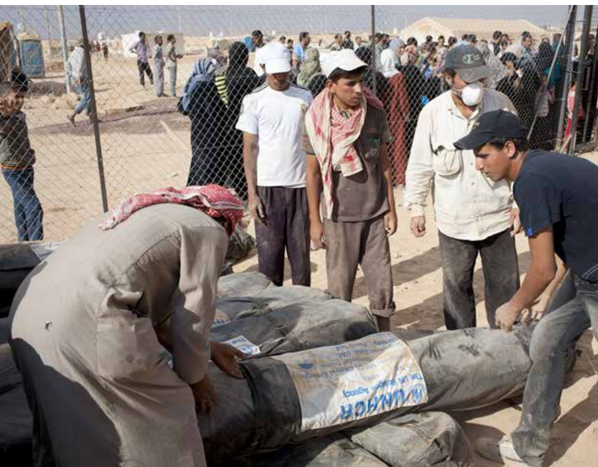
Syrian refugees volunteer carrying tents at a UNHCR distribution centre at the Zaatari refugee camp in Jordan.

The Strategy for Ireland's Rapid Response Initiative is underpinned by Ireland's Humanitarian Assistance Policy. The Rapid Response Initiative is therefore designed to contribute to the goal of Ireland's Humanitarian Assistance Policy which is to save and protect lives, alleviate suffering and maintain human dignity before, during and in the aftermath of natural and man-made disasters, as well as to prevent and strengthen preparedness for the occurrence of such situations.