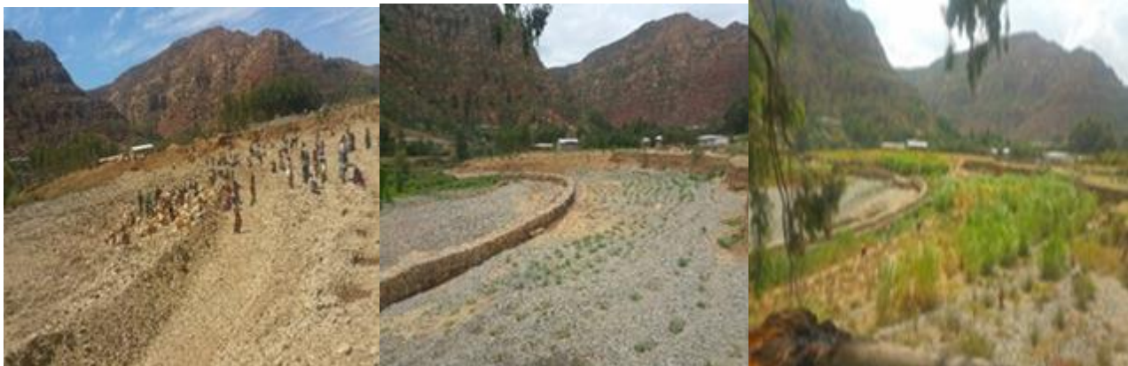
Images above show the change in landscape from a highly degraded area following an Irish Aid supported programme of integrated soil and water conservation and rehabilitation, through a watershed management approach.

In 2014, Irish Aid supported the World Agroforestry Centre (ICRAF) to implement 'Enhancing Integrated Watershed Management with Climate Smart Agriculture in Gergera Watershed', in order to build on the successes and earlier investments in the watershed management approach. The overall objective of the project is to enhance food security and ecosystem resilience through climate-smart landscape management and restoration practices, approaches and technologies and through strengthening of rural institutions and vulnerable community members including women, poor and the youth.