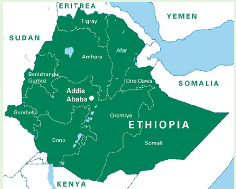
Map of Ethiopia: Irish Aid

Climate Risk Index 2105 5 : 66 out of 187 countries