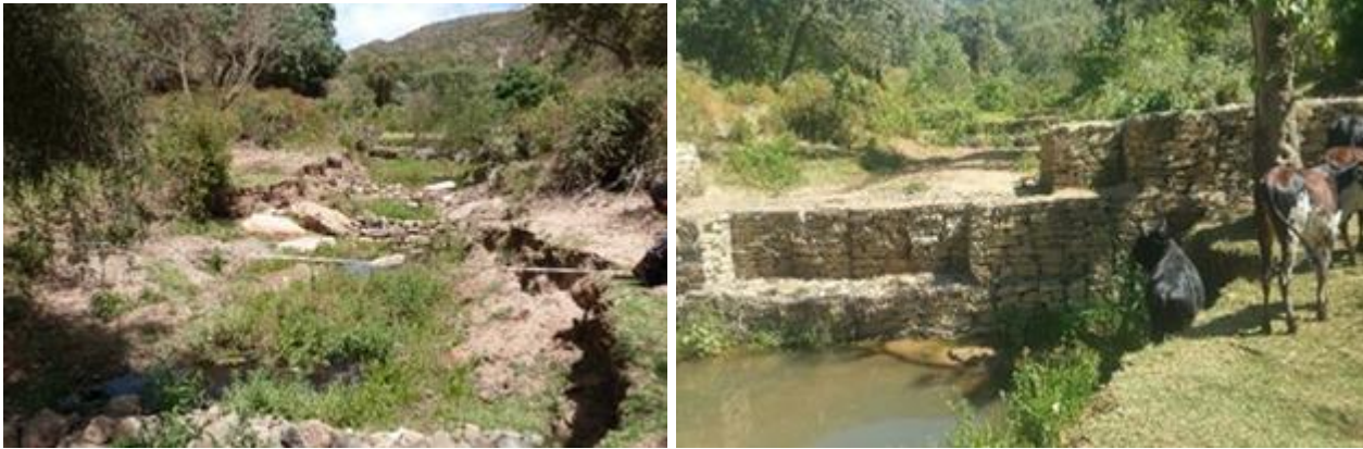
Images above show before and after pictures of the valley following construction of a check dam, which provides a source of drinking water, irrigation and household consumption.

The project is addressing the existing land management gaps, including improper management and utilization of rehabilitated hillsides and grazing lands. As a result about 456 households have benefited in various ways. More than 60 hectares of degraded hillsides and gullies were enriched with economically and ecologically important trees, shrubs and grass species. As a result of the gully maintenance and rehabilitation, a spring was developed below the check dam with water available for drinking (human and livestock), irrigation and household consumption. 5.5 ha of productive land has been reclaimed from the valley and is now being used by 87 landless youth and 23.5 ha of farm land has been saved from being washed away by floods. In addition, one Rural Resources Centre (RRC) was established and ownership transferred to a Gergera Cooperative, comprising of 15 members of landless youth, women and poor farmers, to serve as source of income and job opportunities to these vulnerable groups, while supporting the watershed communities technically, and supplying quality planting materials and agricultural inputs. This RRC is the first of its kind in the region where the government (through Bureaus of Agriculture and Natural Resources) and other organizations are currently keen to replicate across the region as a model.